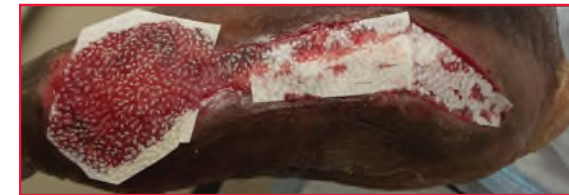
Application of CECM dressing