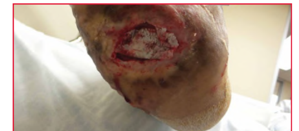
Application of CECM prior to NPWT