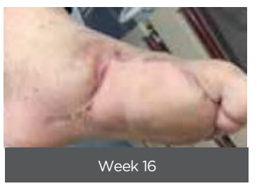
Silverman, A. (2017). Use of an Ovine Collagen with an Intact Extracellular Matrix (CECM) and negative pressure wound therapy (NPWT) as part of the wound management plan following limb salvage surgical intervention in high risk diabetic foot ulcers. Symposium on Advanced Wound Care - Spring, San Diego, CA.