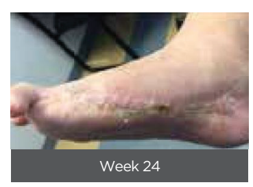
Silverman, A. (2017). Use of an Ovine Collagen with an Intact Extracellular Matrix (CECM) and negative pressure wound therapy (NPWT) as part of the wound management plan following limb salvage surgical intervention in high risk diabetic foot ulcers. Symposium on Advanced Wound Care - Spring, San Diego, CA.