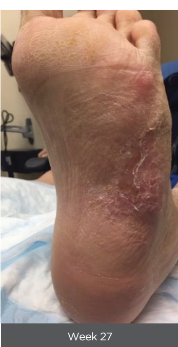
Silverman, A. and G. Valentine (2018). Use of Ovine Extracellular Matrix in Post-Surgical Wounds: A Case Series. Symposium for Advanced Wound Care - Fall, Las Vegas, NV.