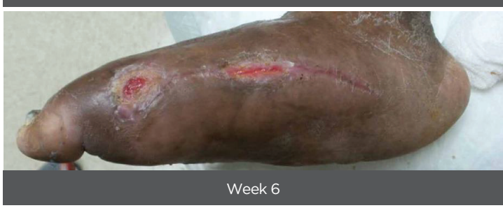
Vidovic, G. and P. Sykes (2016). The use of an ovine collagen extracellular matrix dressing in conjunction with negative pressure wound therapy in the management of chronic diabetic foot ulcers. Symposium on Advanced Wound Care - Fall, Los Vegas, NA.