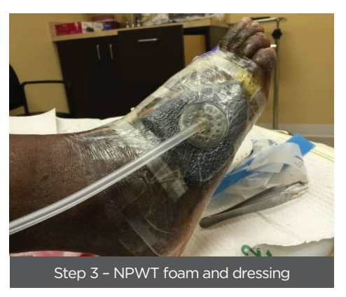
\label{likelihood} Zilberman, I. and N. Zolfaghari (2016). Innovative solutions in the management of wounds with exposed tendons utilizing ovine collagen extracellular matrix and gentian violet and methylene blue antibacterial foams. Symposium on Advanced Wound Care - Atlanta, GA.