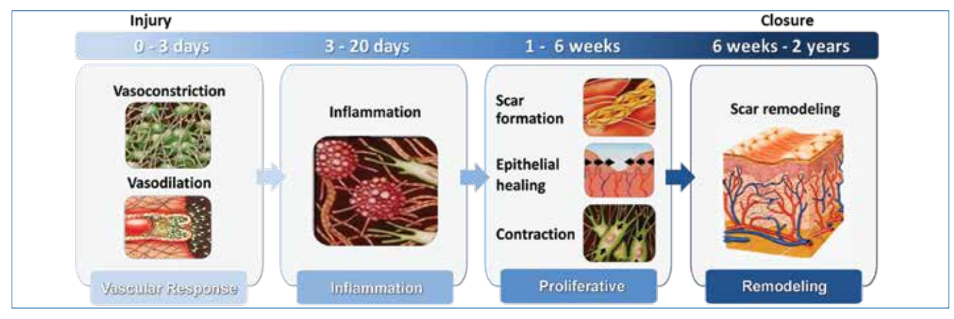
Figure 1. Four phases of wound healing.

As illustrated in Figure 1 , the phases of wound healing overlap.<sup>1,2,4,8,11-13</sup> The duration of each phase is dependent on multiple factors. Wounds that do not progress to healing or that are not responsive to management in a timely manner have defective remodeling of the ECM, fail to reepithelialize, and have prolonged elevated inflammation.<sup>2,11,12,14-20</sup> Wounds in this nonhealing phase are typically referred to as chronic wounds. Chronicity has various causative factors (eg, diabetes mellitus, venous or arterial insufficiency, immunosuppression, a period of immobility leading to prolonged pressure, and infection).<sup>2,12,16</sup>